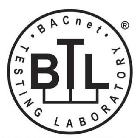
BACnet is a registered trademark of ASHRAE. ASHRAE does not endorse, approve or test products for compliance with ASHRAE standards. Compliance of listed products to requirements of ASHRAE Standard 135 is the responsibility of the BACnet International. BTL is a registered trademark of the BACnet International.